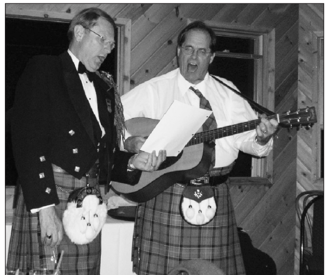
The Dram Boys

This is a fun evening and the only Social Event of the year. We look forward to seeing you all there.